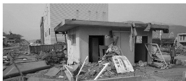
Figure 2. The proceedings should not exceed 6 page including tables, figures, references, footnotes, etc.