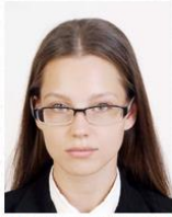
The frames of my glasses are hanging over my eyes