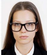
The frames of the glasses are very thick