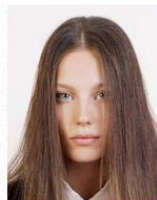
The eyes are hidden by the bangs