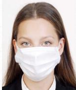
A mask covers part of the face