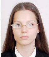
The light is reflecting off the glasses